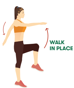
WALK IN PLACE